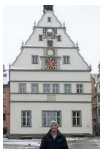
Brady Gaumer in Germany – Intersession 2019

FSU students have the opportunity to study abroad all over the world.