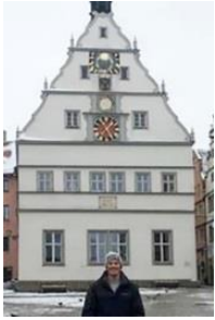
Brady Gaumer in Germany – Intersession 2019

FSU students have the opportunity to study abroad all over the world.