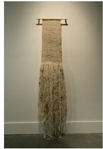
"Another Time Once More" shredded clothing from the inside of a punching bag, cotton thread, wood and metal curtain hooks 71 x 18.25 x 4.5 in.

Congratulations April! What an honor! Be sure to check the show out if you're in the area next spring or summer.