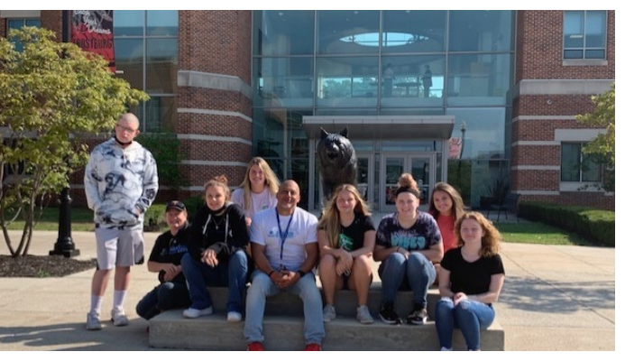
awareness and college completion for low-income Maryland high school students.

The Next Generation Scholars is a state grant program that provides funding for college access through nonprofit organizations to enhance college and career awareness and college completion for low-income Maryland high school students. Seven high school students from Fort. Hill and Allegany High Schools in Cumberland, Maryland, explored Frostburg State University's beautiful campus and various programs. A total of 18 programs from across campus participated in Jump Start Your Future Day. This was a total Next Generation Scholars (NGS) is a state grant program established interdisciplinary learning experience! Some highlights from by Maryland House Bill 1403 (2016) that provides funding for college the day included a hands on 3D augmented reality sandbox access through nonprofit organizations to enhance college and career experiment from the geography department, an EcoBrick demonstration from the sustainability department, a tour of the