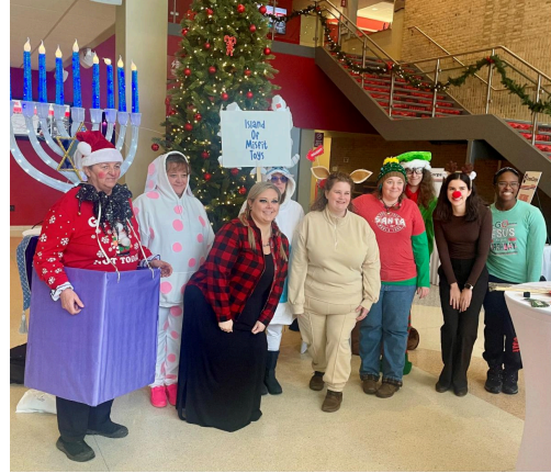
Group Award: Residence Life, the Masters of Misfit Magic!