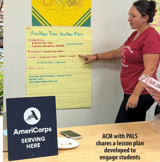
ACM with PALS shares a lesson plan developed to engage students

Established in 1994, ASTAR AmeriCorps program, has engaged more than 2,000 AmeriCorps members to address community needs. As a statewide initiative with a core emphasis on capacity building, ASTAR collaborates with 75 community-connected partners across Maryland, with a special focus on rural areas.