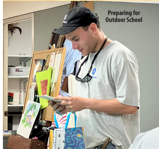
Preparing for Outdoor School