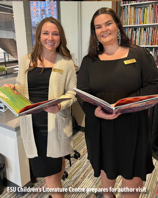
FSU Children's Literature Centre prepares for author visit