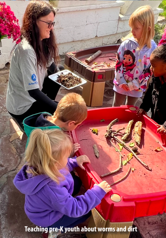
Teaching pre-K youth about worms and dirt