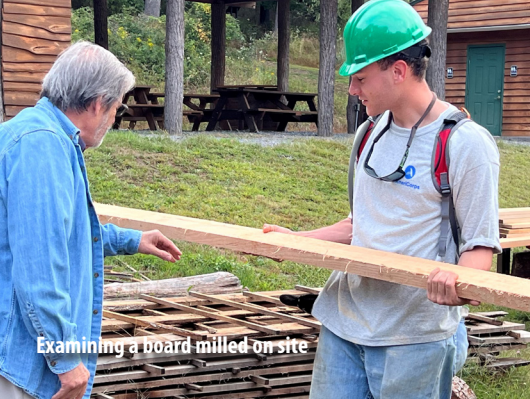
Examining a board milled on site