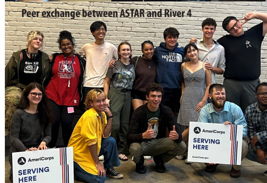
Peer exchange between ASTAR and River 4