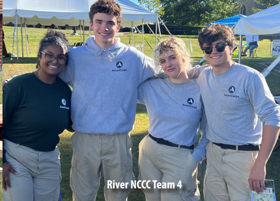
River NCCC Team 4