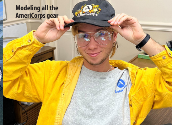
Modeling all the AmeriCorps gear