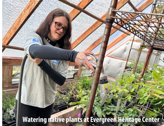
Watering native plants at Evergreen Heritage Center

University System of Maryland at Hagerstown 32 West Washington Street Hagerstown, MD 21740-4681