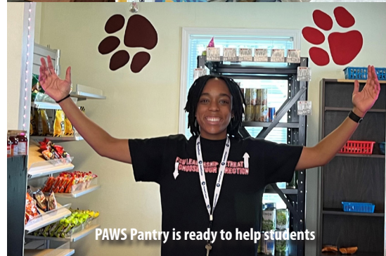
PAWS Pantry is ready to help students